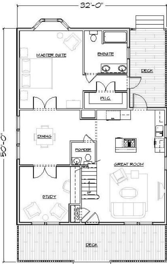
MAIN FLOOR PLAN 1207 sq. ft.

COPYRIGHT © 2009 MARTIN DRAFTING & DESIGN, Inc. JOEY MARTIN, AIBD